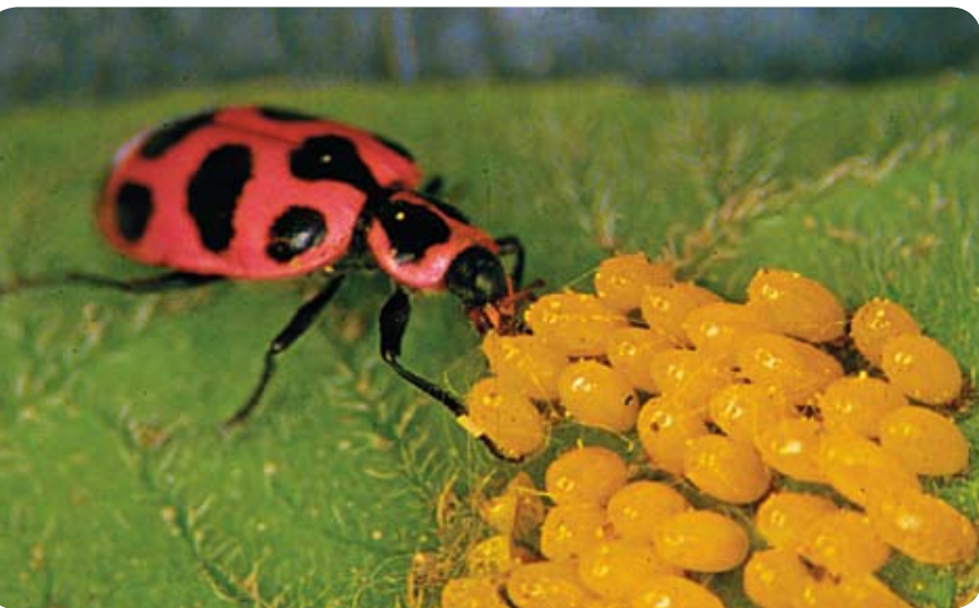
Pink spotted ladybird predator feeding on eggs of Colorado potato beetle.